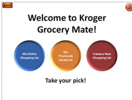
Figure 6: Screen for choosing list type