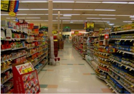
Figure 3: This figure depicts the vast array of items at a grocery store

specific to the nutritional needs of the homeless whom charitable organizations serve.