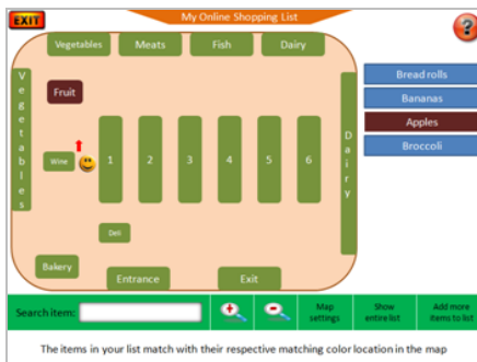
Figure 7: Screen showing dynamic map of store and color-coded item mapping