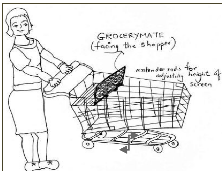
Figure 5: Design Sketch depicting the placement of GroceryMate on the grocery cart

Our proposed design, the GroceryMate, is light-weight, weather resistant, and detachable; it will be mounted on to a shopping cart with extendable rods for height adjustment (figure 5). The shopper can use the GroceryMate to locate items on their grocery list. The shopper can create a shopping list while using the touch-screen device, access a previously saved list, or connect to a shopping list which the shopper created online at the grocery store's website. The GroceryMate displays a dynamic map of the store. It guides the shopper through the store by identifying the location of the items on shopper's grocery list and calculating the