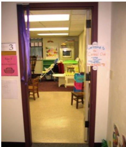
Figure 2: Special room for feeding homeless children at the Shalom Community Center

human beings require daily intake of nutritional food that conforms to dietary guidelines proposed by agencies such as the United States Department of Health and Human Services [20].