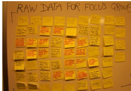
Figure 4: We used Affinity Diagramming to organize data gathered from user research

On an average, consumers in the United States shop at the grocery store two and a half times per week [10]. It is advantageous to target grocery shoppers, since doing so allows us to leverage mass participation, as well as balanced and frequent community participation. From our research, we found that ninety percent of Americans offer donations to nonprofit organizations [18]. From this, we concluded that the average American grocery shopper would be willing to contribute an affordable food donation to alleviate hunger and malnutrition among the homeless.