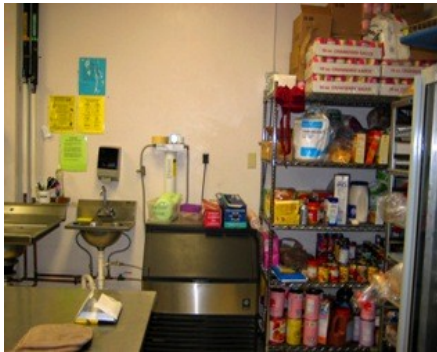
Figure 1: Insufficient food items present at the Shalom Community Center